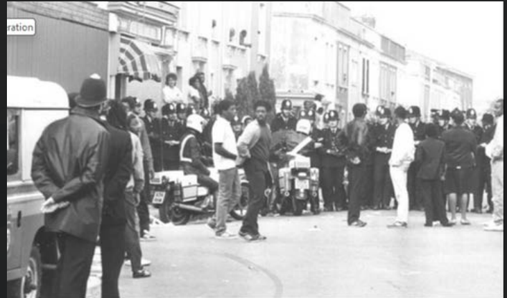
St Pauls riots, 1980

Students have been asked to consider if they would like to present in the final week of term assemblies anything from their own experience of black history – whether this is stories of their heritage, community or family. They have also been asked to consider entering the Black History Poetry Competition, where anyone can submit a poem about a pioneering black woman who has made an impact in their chosen field, and why she is an inspiration to them. The person does not need to be famous and could even be family. Click here to enter!