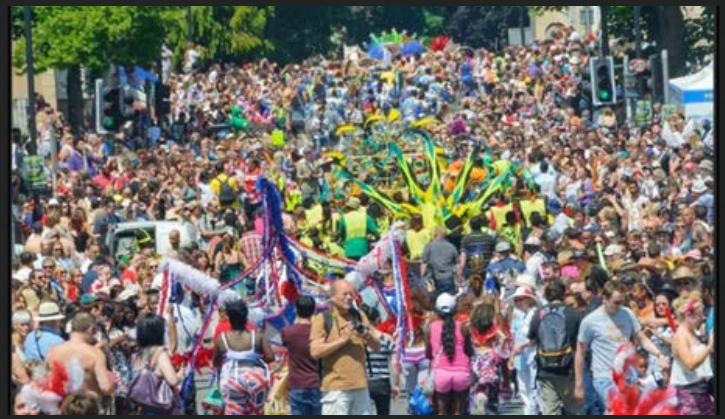
St Pauls Carnival