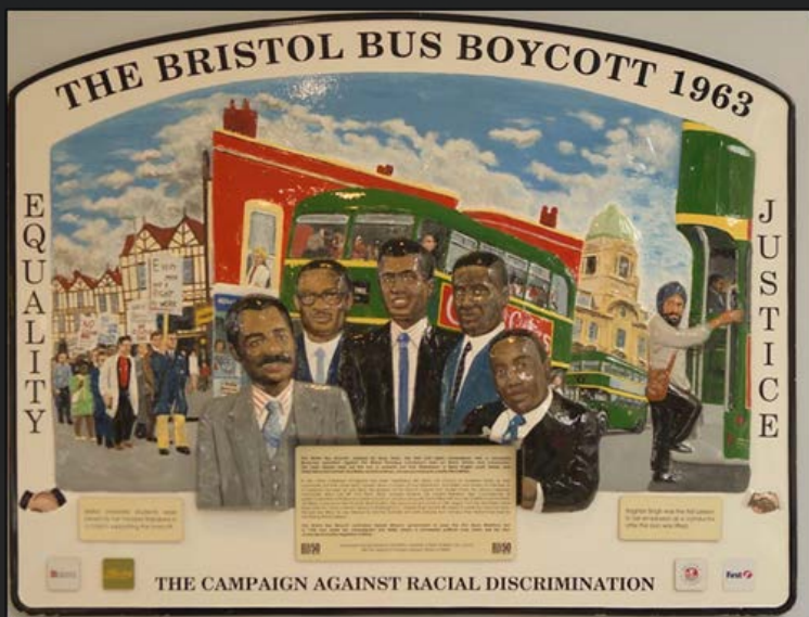
The Bristol Bus Boycott, 1963

Assemblies this week have looked at Bristol's own difficult history, alongside the strength of activism and change that have inspired change in both Bristol and the rest of the UK. Students have heard in more detail about the impact of Windrush on Bristol, its music and its people, and the fight for racial equality demonstrated through the Bristol Bus Boycott, St Pauls riots, the toppling of the Colston statue, and the appointment of the city's first black mayor, Marvin Rees.