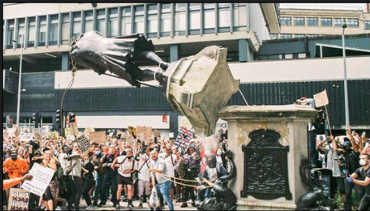
Toppling of Colston Statue, June 2020

People from African and Caribbean backgrounds have been a fundamental part of British history for centuries – but campaigners believe their contributions have often been overlooked, and Black History Month seeks to raise this awareness, promote and celebrate this contribution. Each year Black History Month takes a different focus, and this year the focus is on the crucial role that black British women have played in shaping, history, inspiring change and building communities.