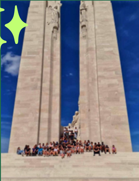
Students at the Canadian memorial at Vimy Ridge